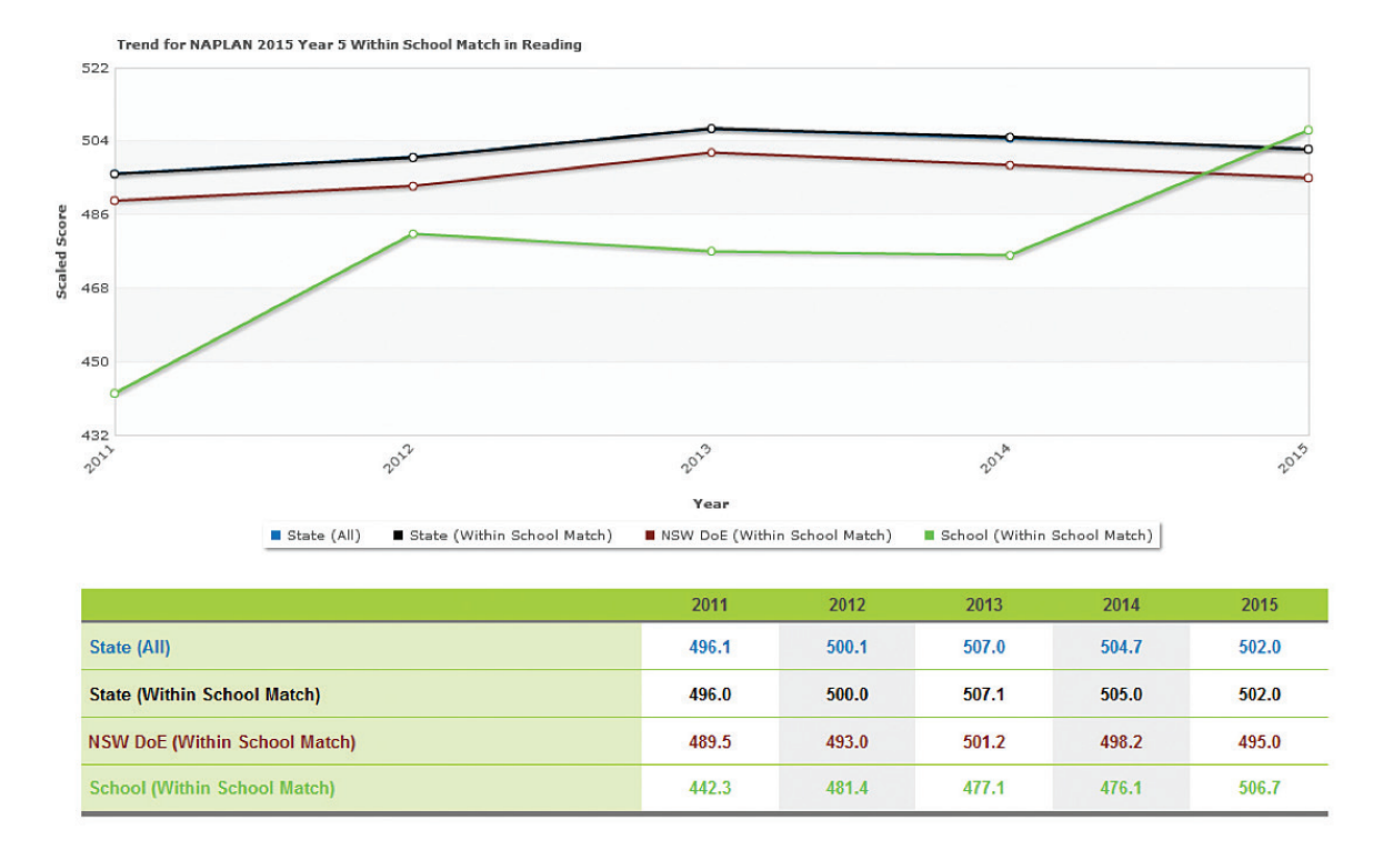
Figure 1. Year 5 NAPLAN Reading results 2011 to 2015.

a substantial amount of National Partnership money, and asked how she thought we could best spend part of it. With little hesitation, she mentioned MultiLit. Soon I was provided with research on literacy and a brief of the program. It certainly had my attention and interest.